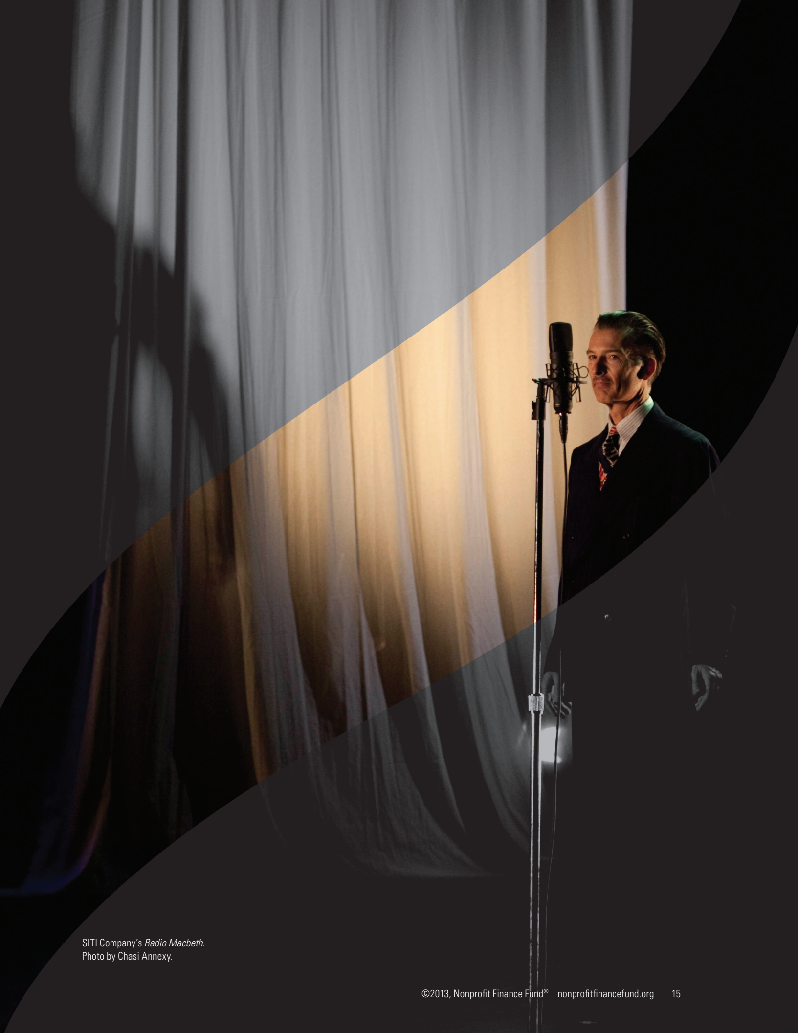
SITI Company's Radio Macbeth.