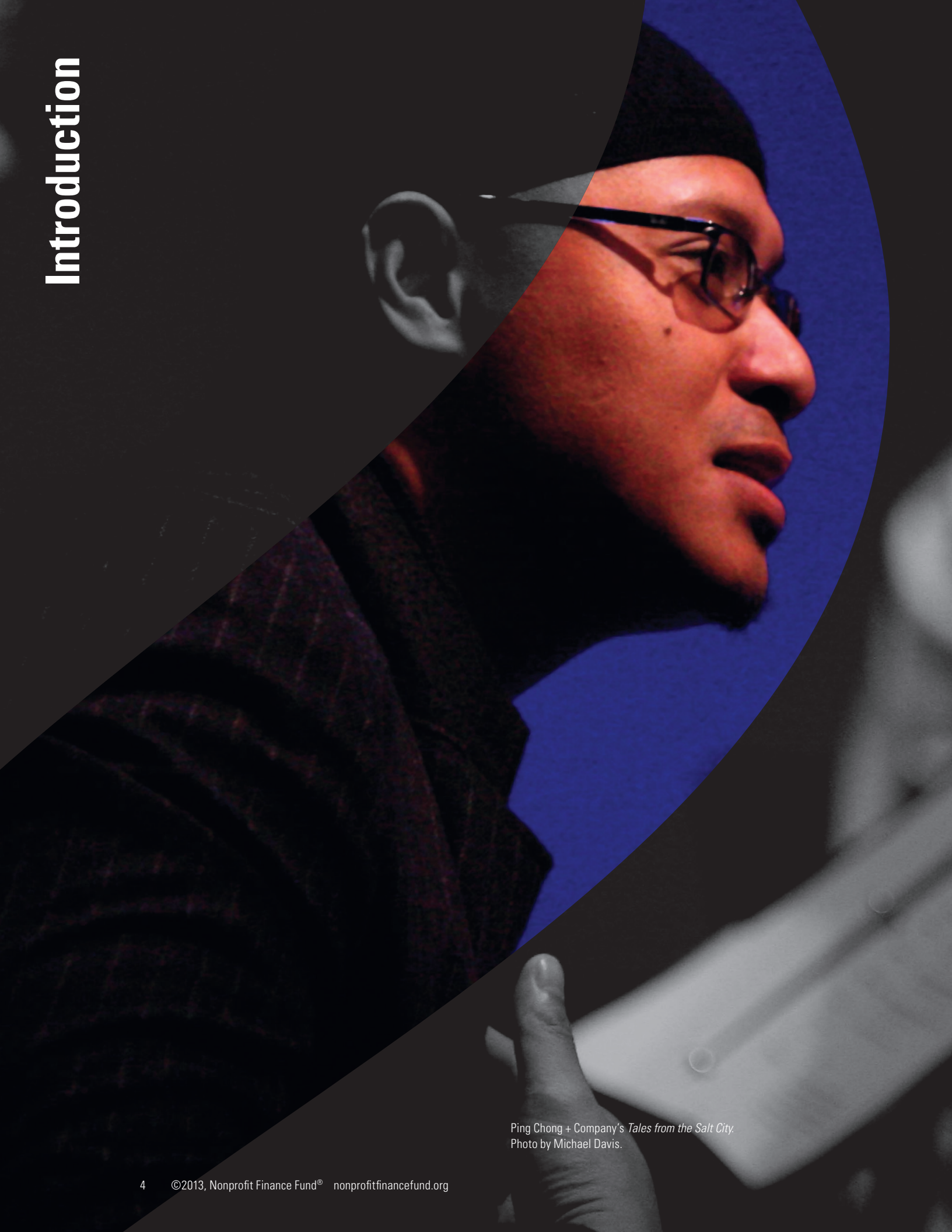
Ping Chong + Company's Tales from the Salt City.